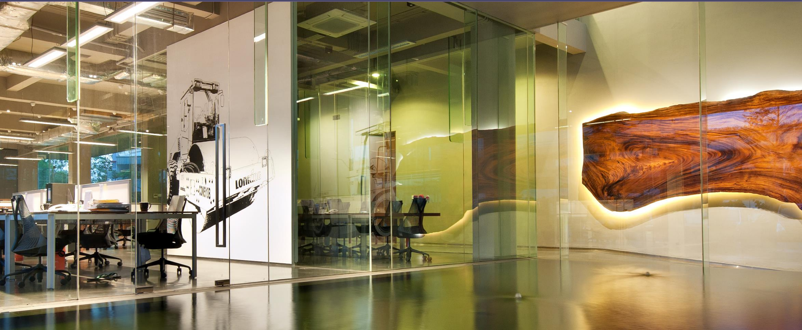
JAKARTA HEAD OFFICE