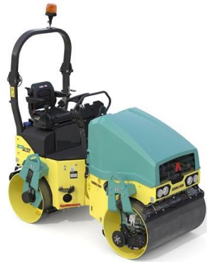
ARX26 – ARX40 Light tandem roller