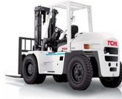
FD35T9 – FD100T9 3.5-ton – 10-ton diesel (automatic)