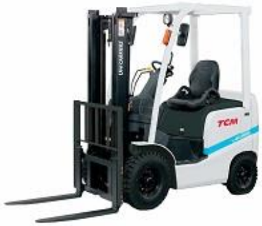
FD20C3Z – FD30C3Z 2-ton – 3-ton diesel (manual)