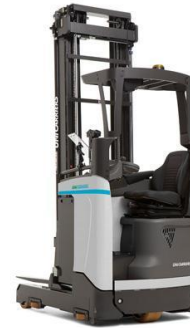
COMING SOON TCM (Atlet) electric reach trucks