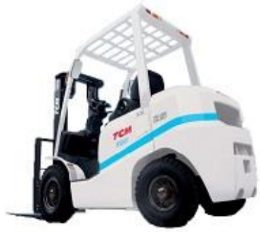
FD20T3Z – FD30T3CZ 2-ton – 3-ton diesel (automatic)