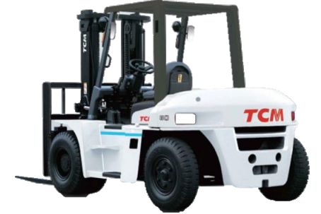
FD60Z8 – FD100Z8 6-ton – 10-ton diesel (automatic)