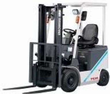
FB10-8 – FB35-8 1.0-ton – 3.5-ton electric counterbalance