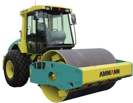
ARS122 Single drum roller