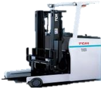
FRB10-8 – FRHB30-8 1.0-ton – 3-ton electric warehouse trucks