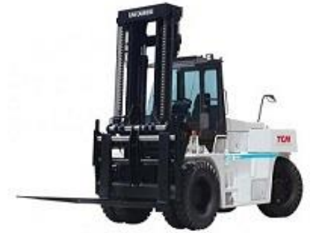
FD150S-3 – FD300S-3 15-ton – 30-ton diesel (automatic)