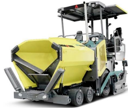
AFX400-2 – AFX700-2 Asphalt paver